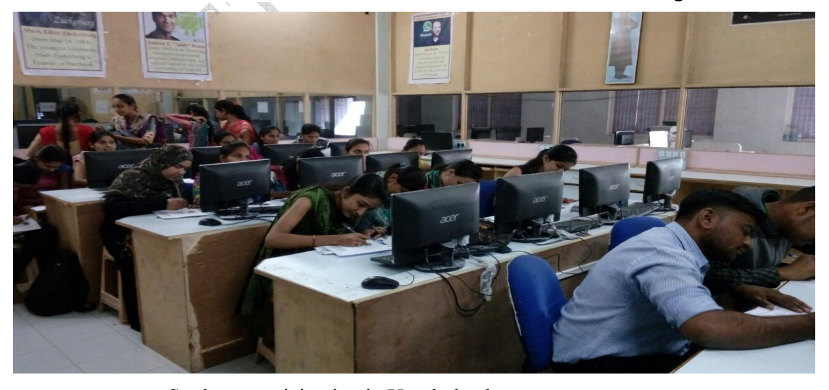
Students participating in Youth day best message contest.

institute by UG and PG department on 12th Jan 2017.institute students conducts best message contest in 22 different colleges in NMU region. Total 30 students of institute conducts this contest along with 12 faculties