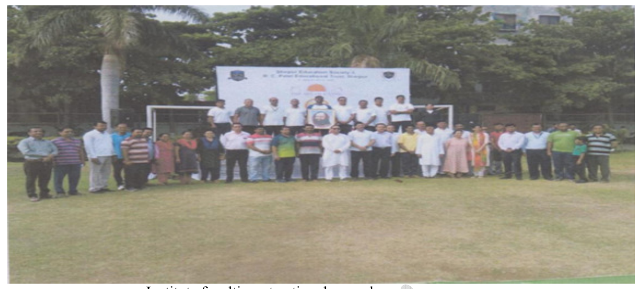
Institute faculties at national yoga day