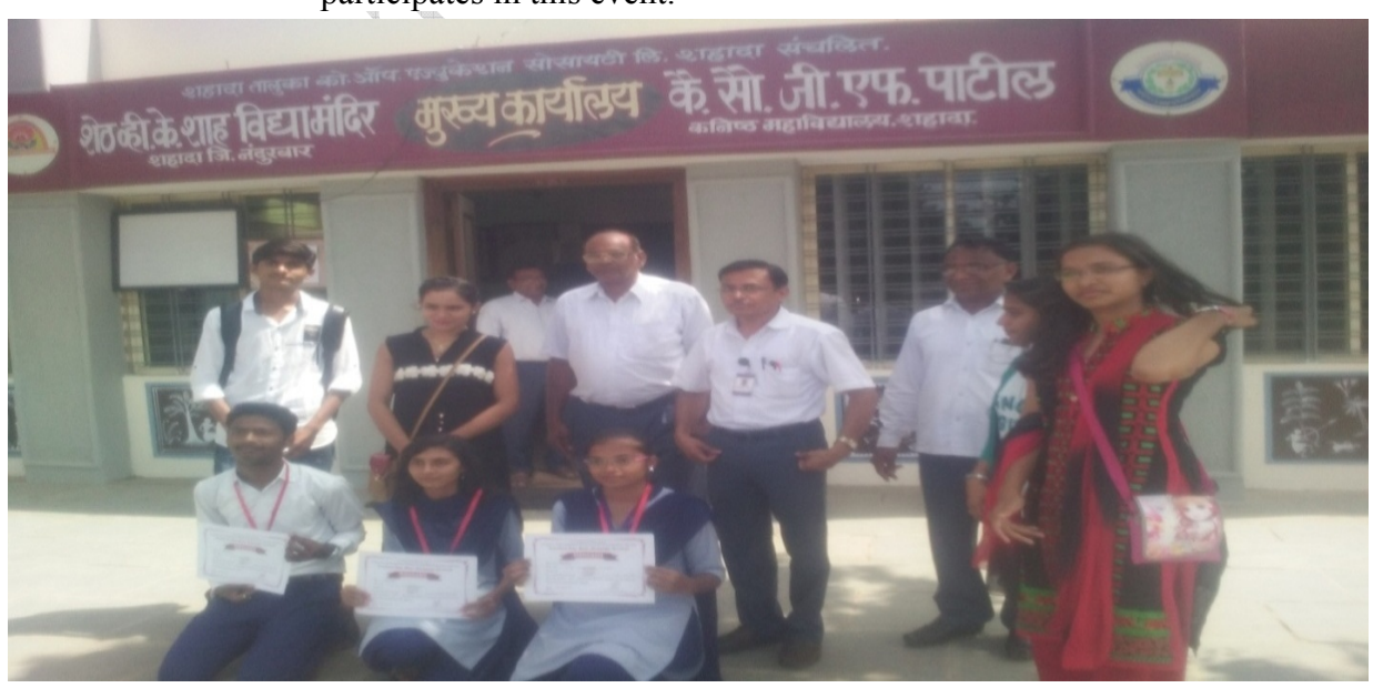
Winning students awarded with certificates.