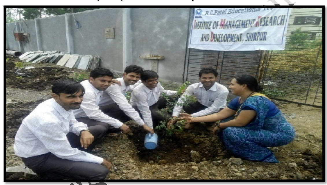
Institutefaculties planting trees at RCP Polytechnic College, Shirpur

students were participated in this activity.