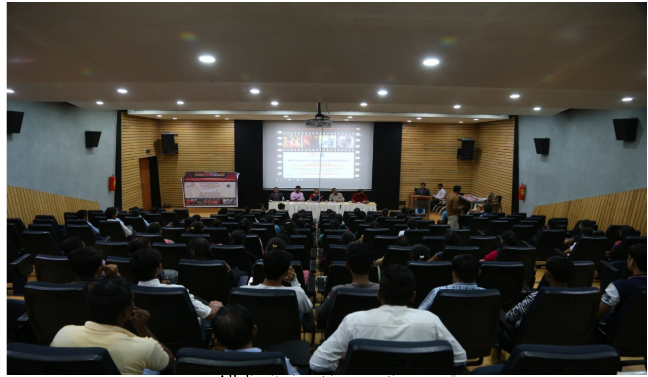
All dignitaries at inauguration