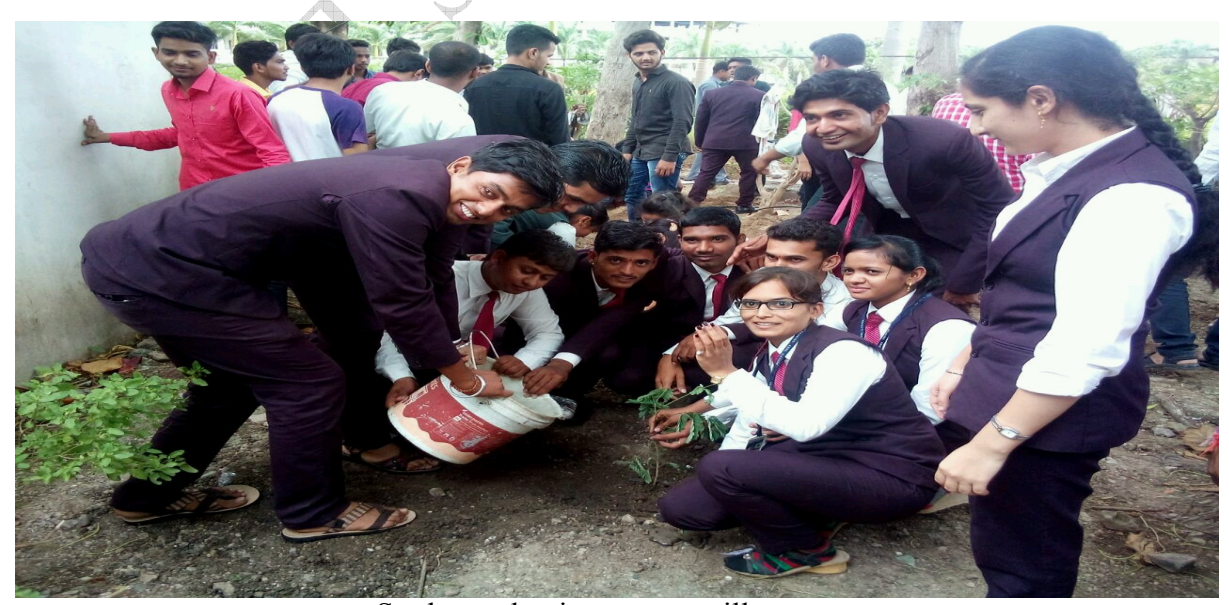
Students planting trees at villege.