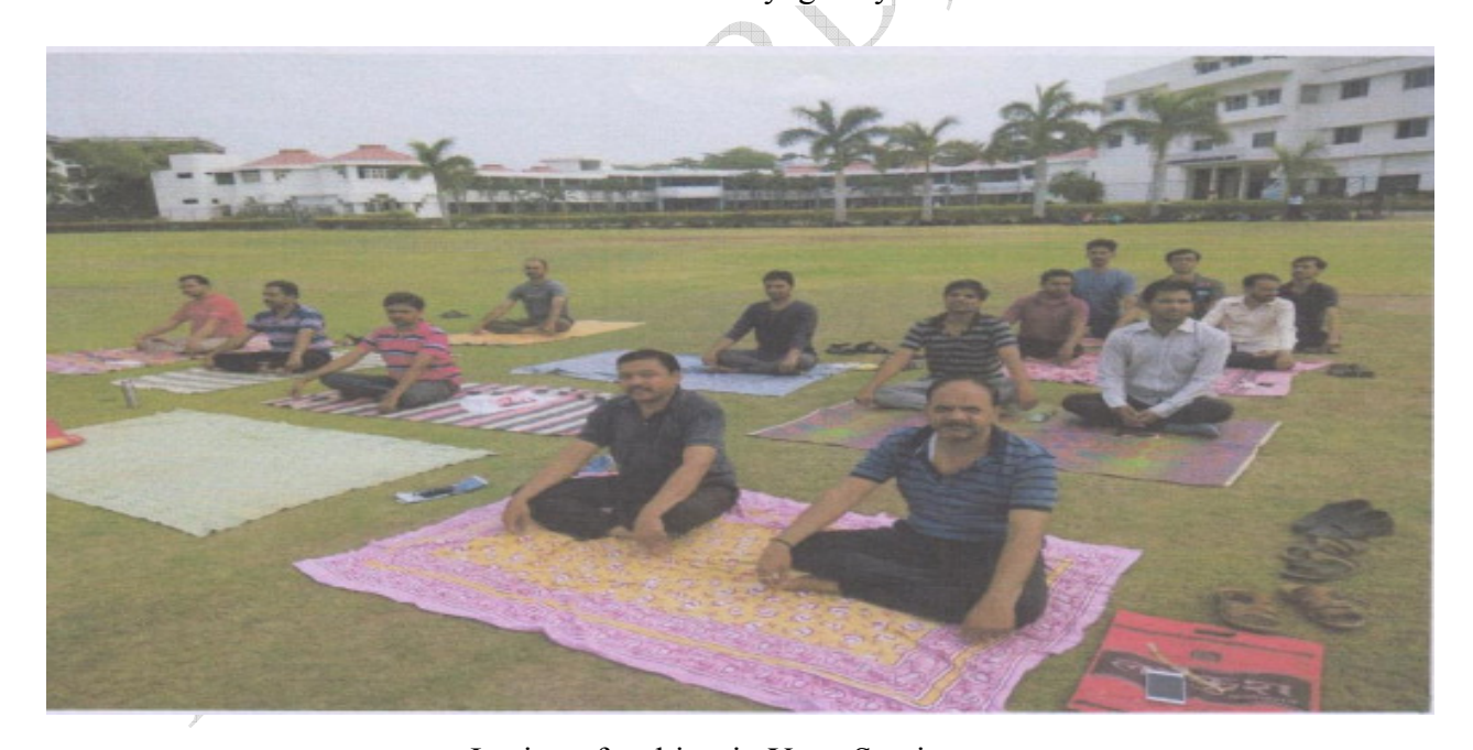
Institute faculties in Yoga Session