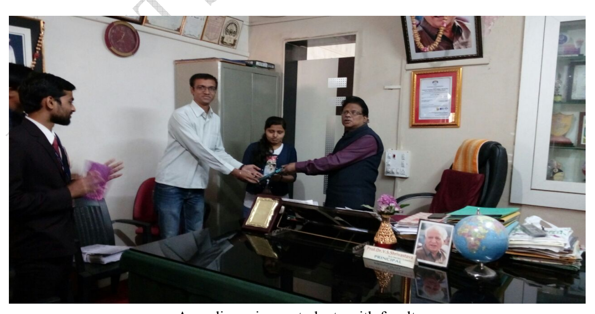
Awarding winner students with faculty.