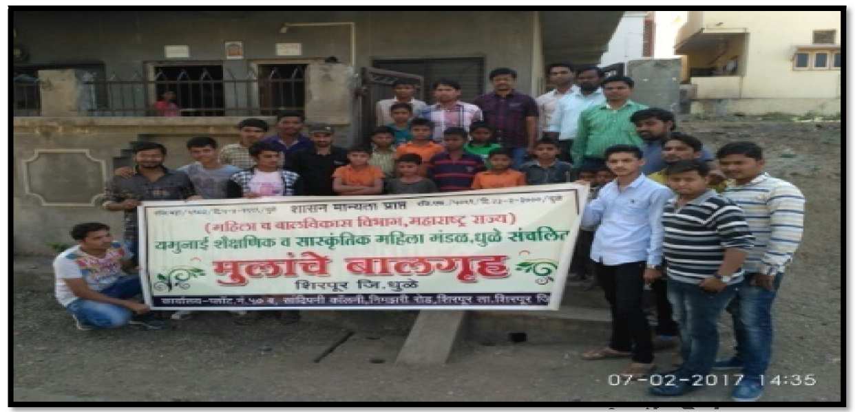
Faculties and students distributing collected study material to students.