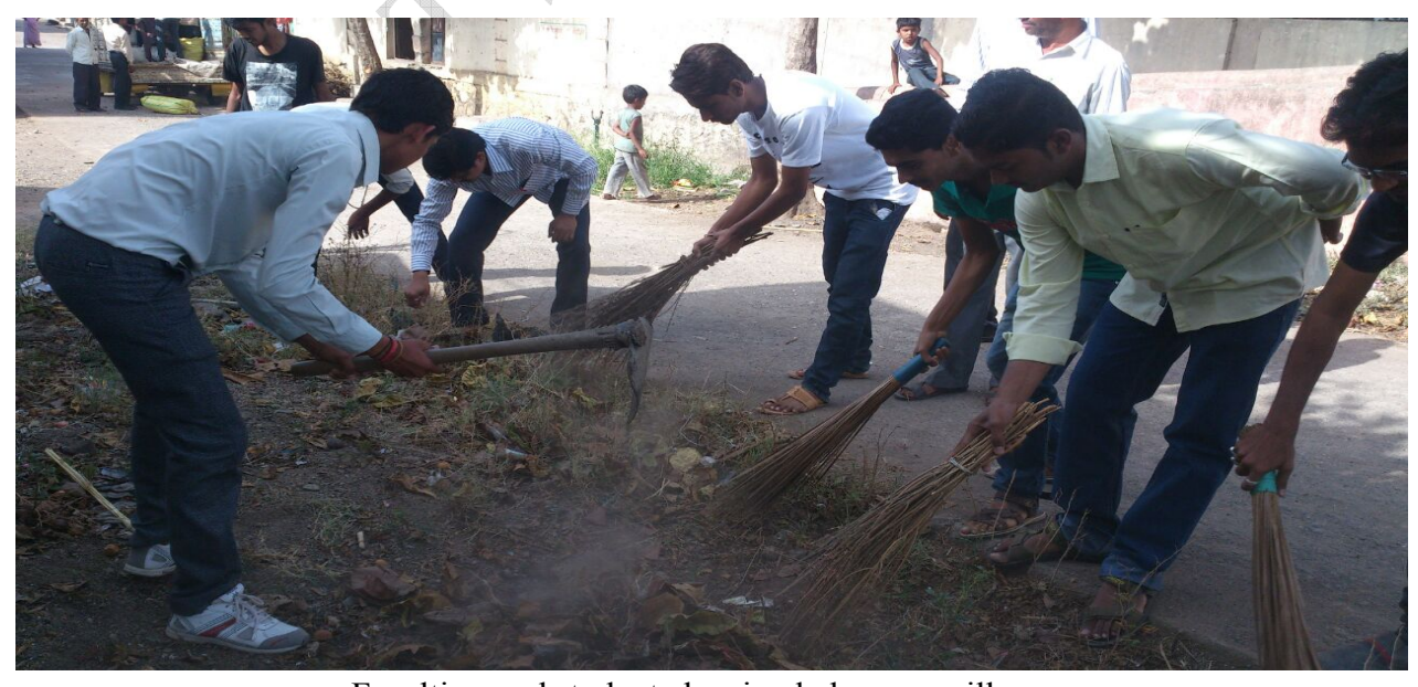
Faculties and student cleaning kalamsare village.