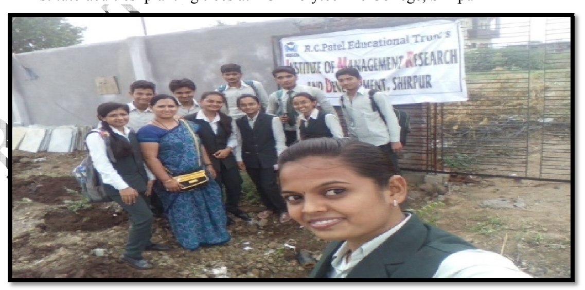
Student and faculties planting tree in R.C.Patel Polytechnic College.