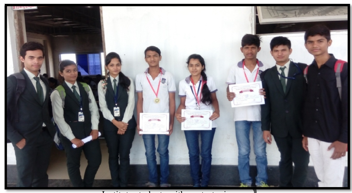
Institute students with contest winners

Event Name : Ek Hath Madticha Event Type : Social Program Date : 1 -14 Jan 2017