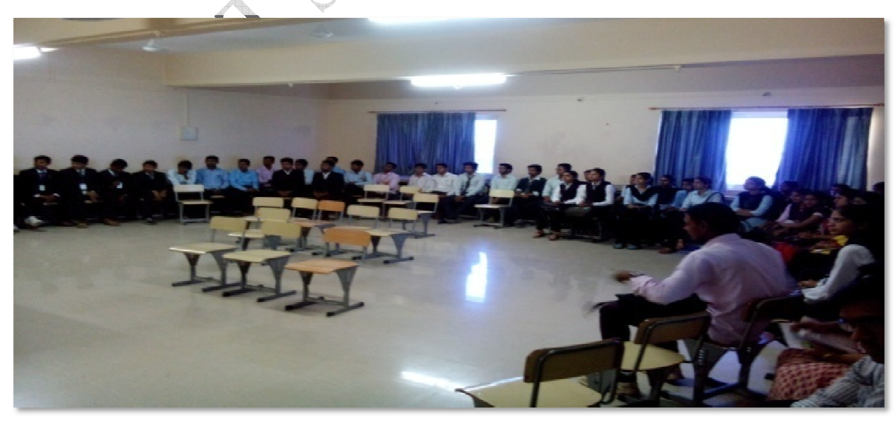
Student and staff participating in workshop