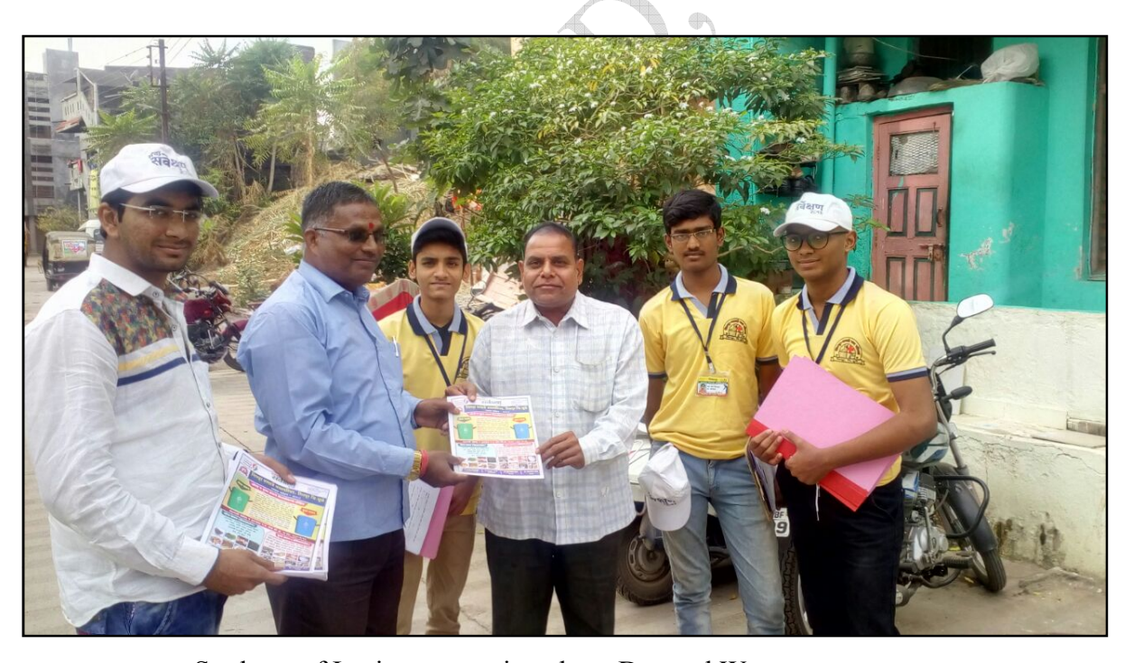
Students of Institute awearing about Dry and Wet weste.

The campaign strategy was focused on approaching the masses such that maximum population is covered as well as the effects that are seen in the region are widespread and long lasting. The campaign addressed issues of personal hygiene, public sanitation conditions, lack of awareness and the general issue of public attitude that withholds the population in taking a proactive attitude towards the problem, i.e., the cleanliness students are 105 participated in this event.