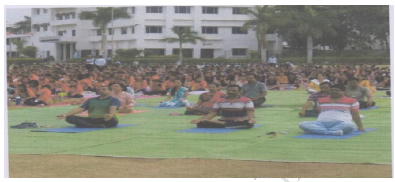
InstituteStudent in yoga session