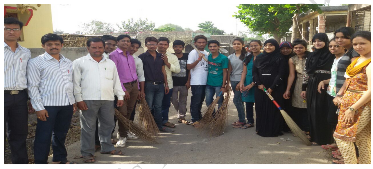
Faculties and student in swacha bharat abhiyan at kalamsare